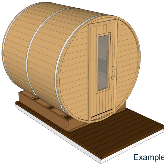
Example : wooden decking on a concrete foundation

Preparing a suitable foundation for your barrel sauna.